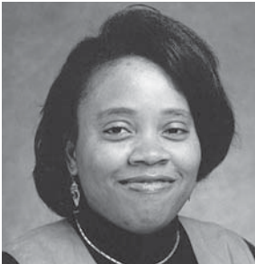
LORI LAMAR EVENT MANAGEMENT